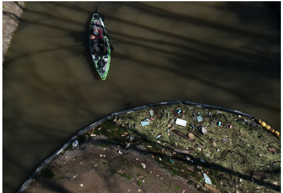
Bayou Fountain boom.

We began this work in earnest in 2014 when we were awarded an EPA grant to conduct water quality assessments of Ward Creek. The purpose of this project was to develop a plan for sustainable stormwater monitoring to make better operational decisions on construction and drainage projects to improve water quality and flood protection across the parish. The results of this project set the foundation for Burden to be one of the primary research and demonstration sites for stormwater management.