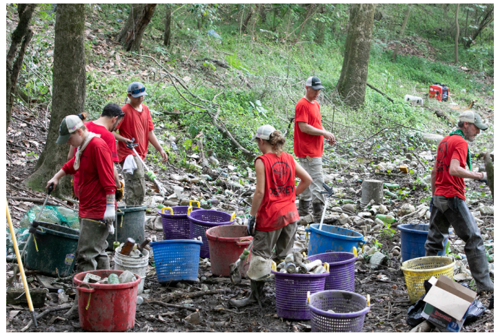
Cleanup by Osprey Initiative of Site 3.