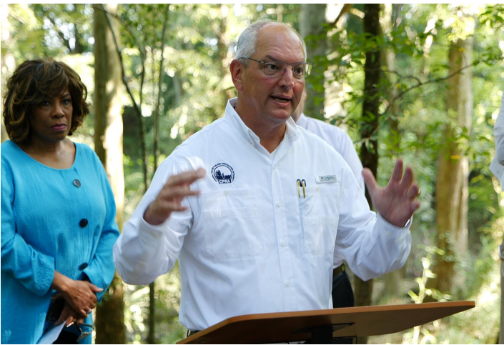
Gov. John Bel Edwards speaks at the stormwater press conference.