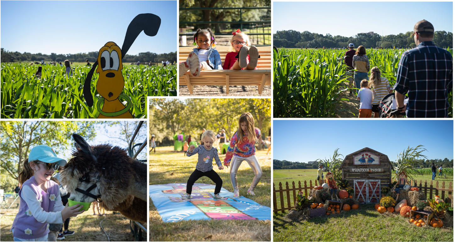
Top row (left to right): Visitors find their way out of the Corn Maze. Young children enjoy a swing. Families stroll through the maze. Bottom row (left to right): An alpaca is being fed by a young girl. Children play one of the many games at Corn Maze. A country scene makes a great photo backdrop.